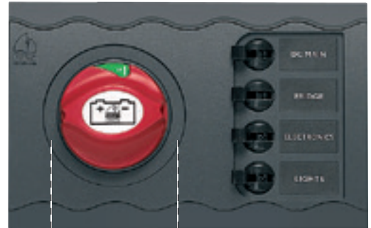
As shown in Contour Connect panels