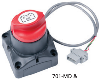
701-MD & 701-MDCZ