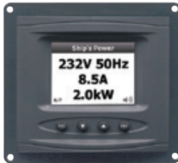
Part # 80-600-0027-00