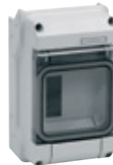
MCB-3WENC 6.3" x 3.6" x 3.5" 160 x 92 x 90 mm